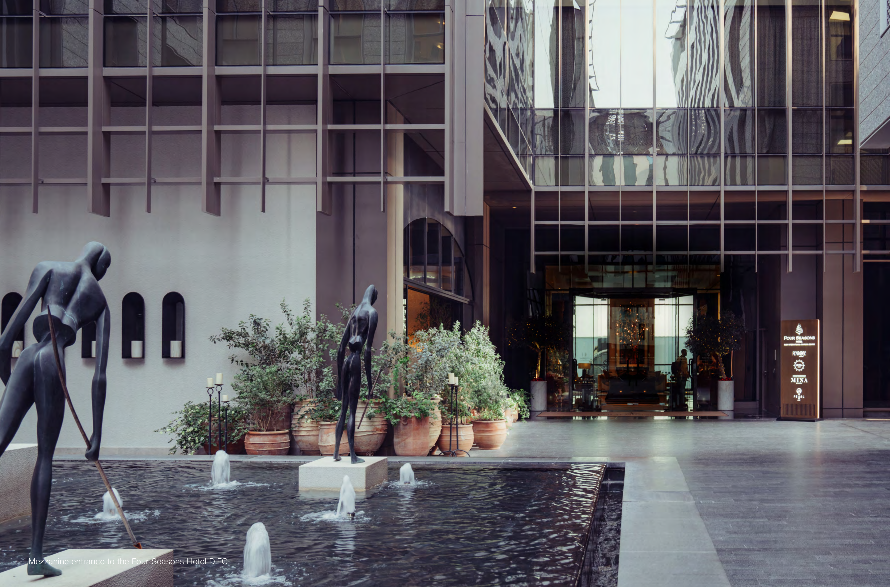
Mezzanine entrance to the Four Seasons Hotel DIFC