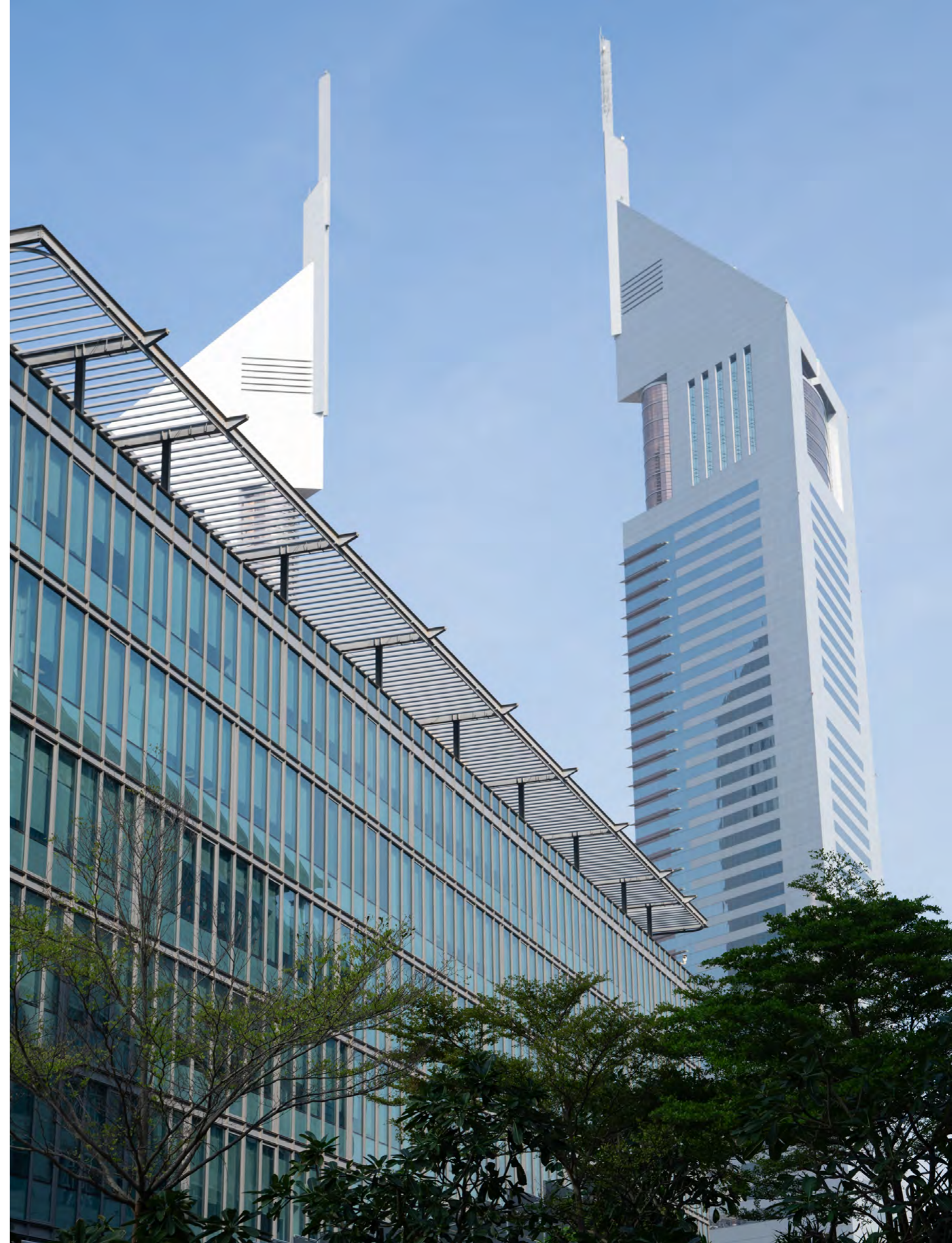
Right Emirates Towers seen from DIFC Gate Village