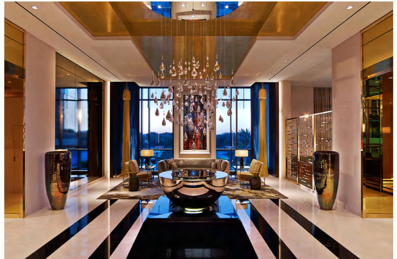
Above Four Seasons Hotel DIFC, Dubai, UAE Left Tihany Studio