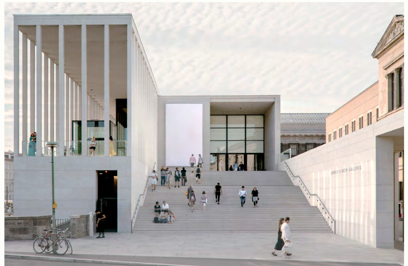
Above James-Simon-Galerie, Museumsinsel, Berlin, Germany, 1999-2019 Left Amorepacific Headquarters, Seoul, South Korea, 2010-17