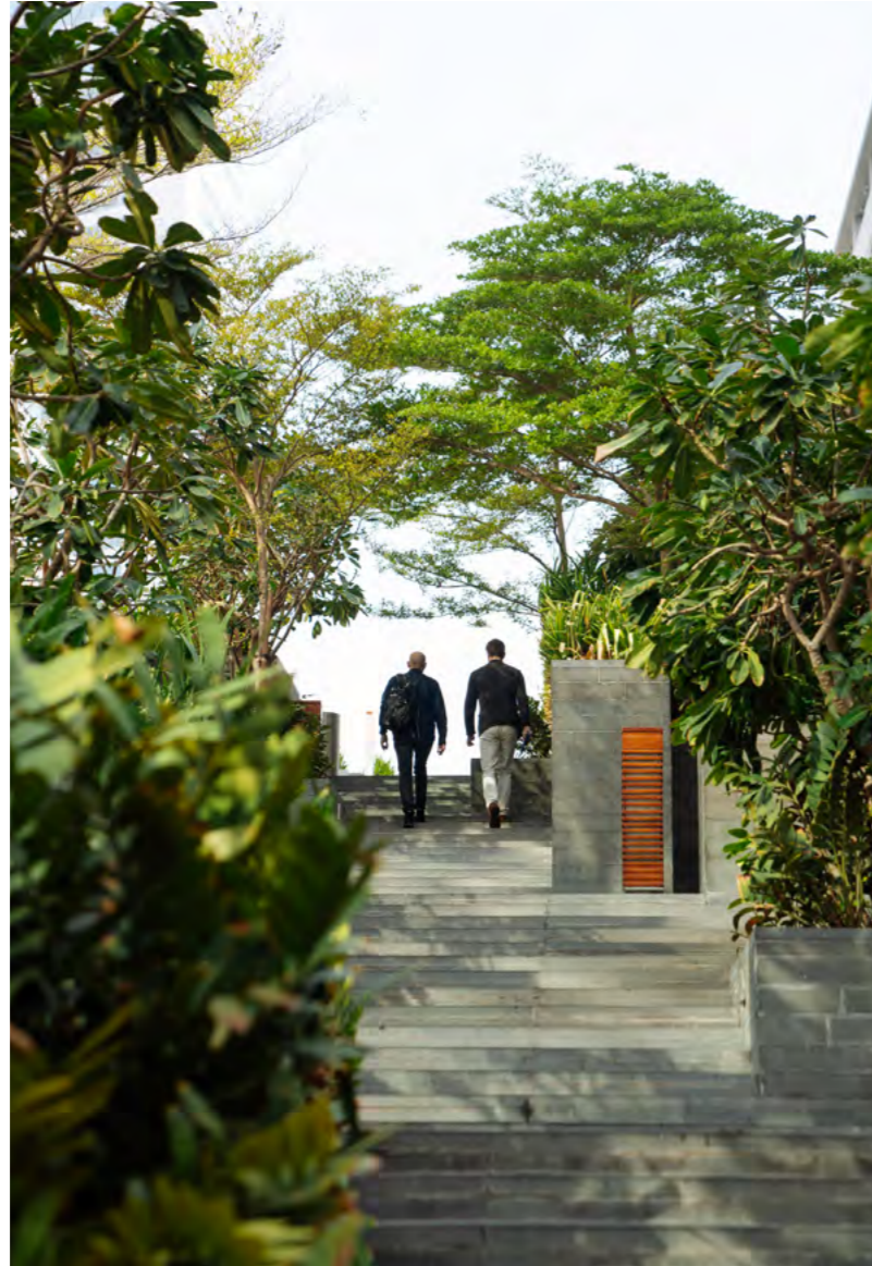
Above DIFC Gate Village