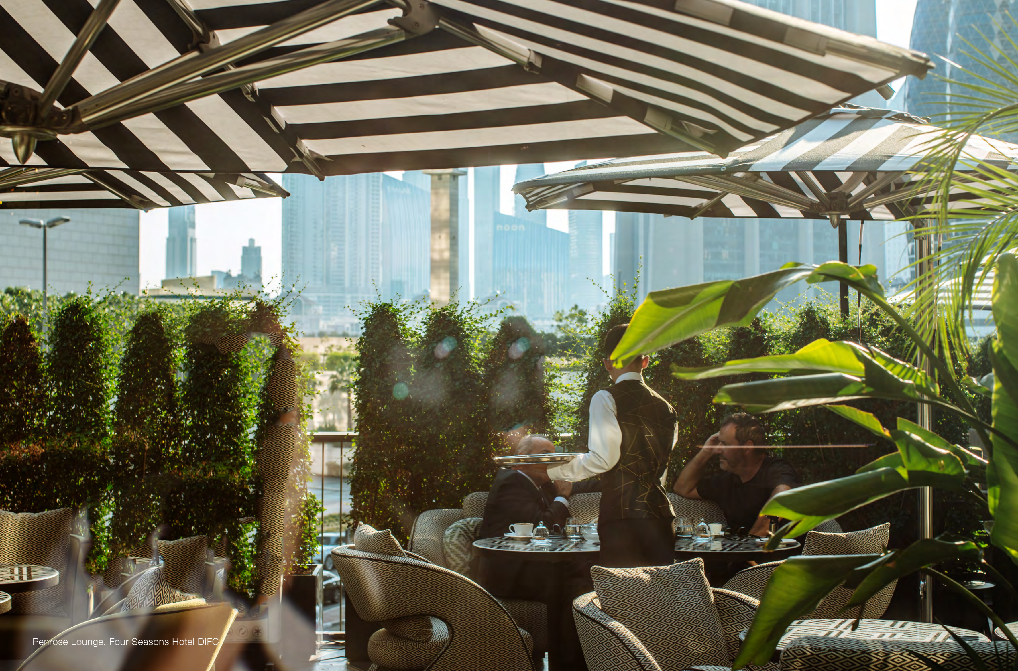
Penrose Lounge, Four Seasons Hotel DIFC