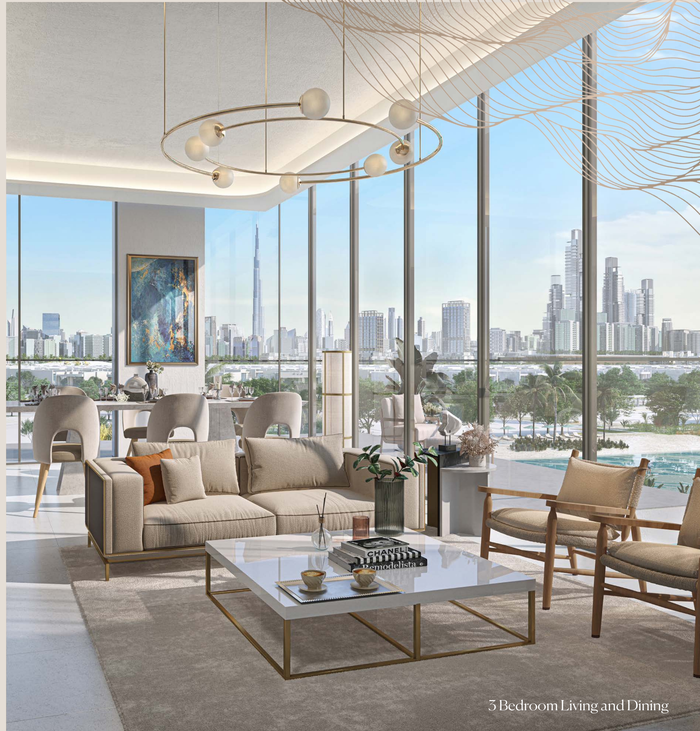
3 Bedroom Living and Dining