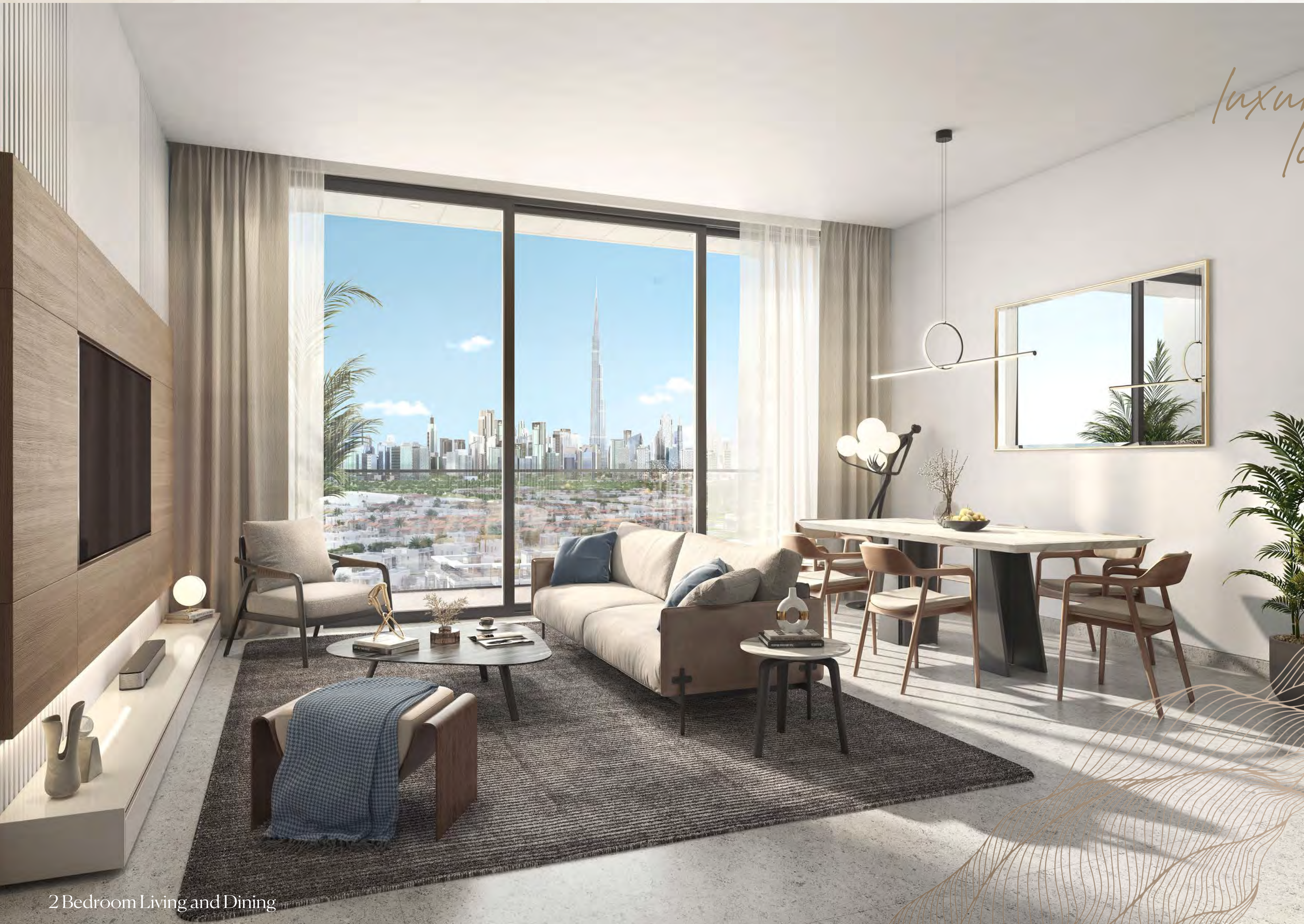
2 Bedroom Living and Dining