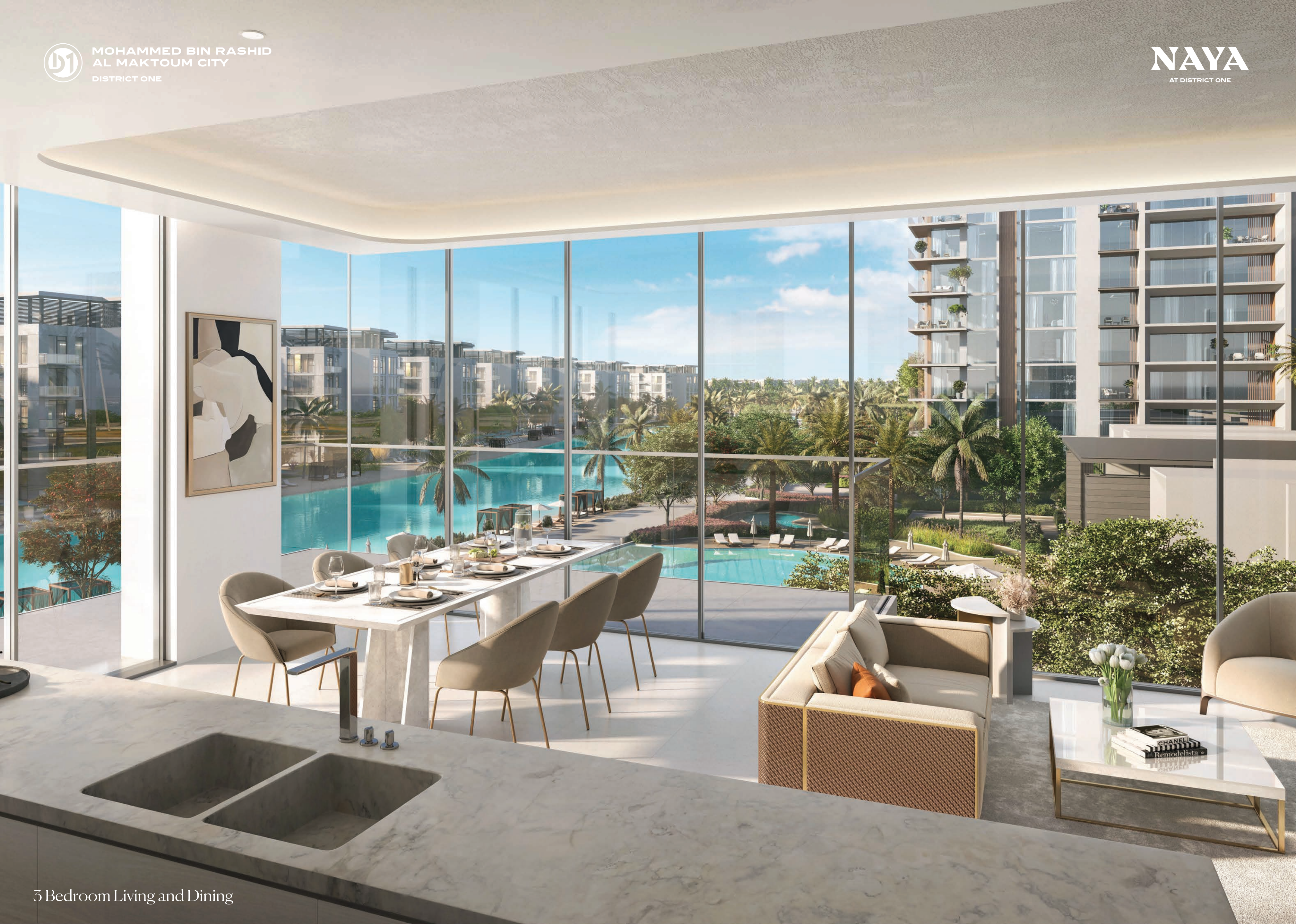
3 Bedroom Living and Dining