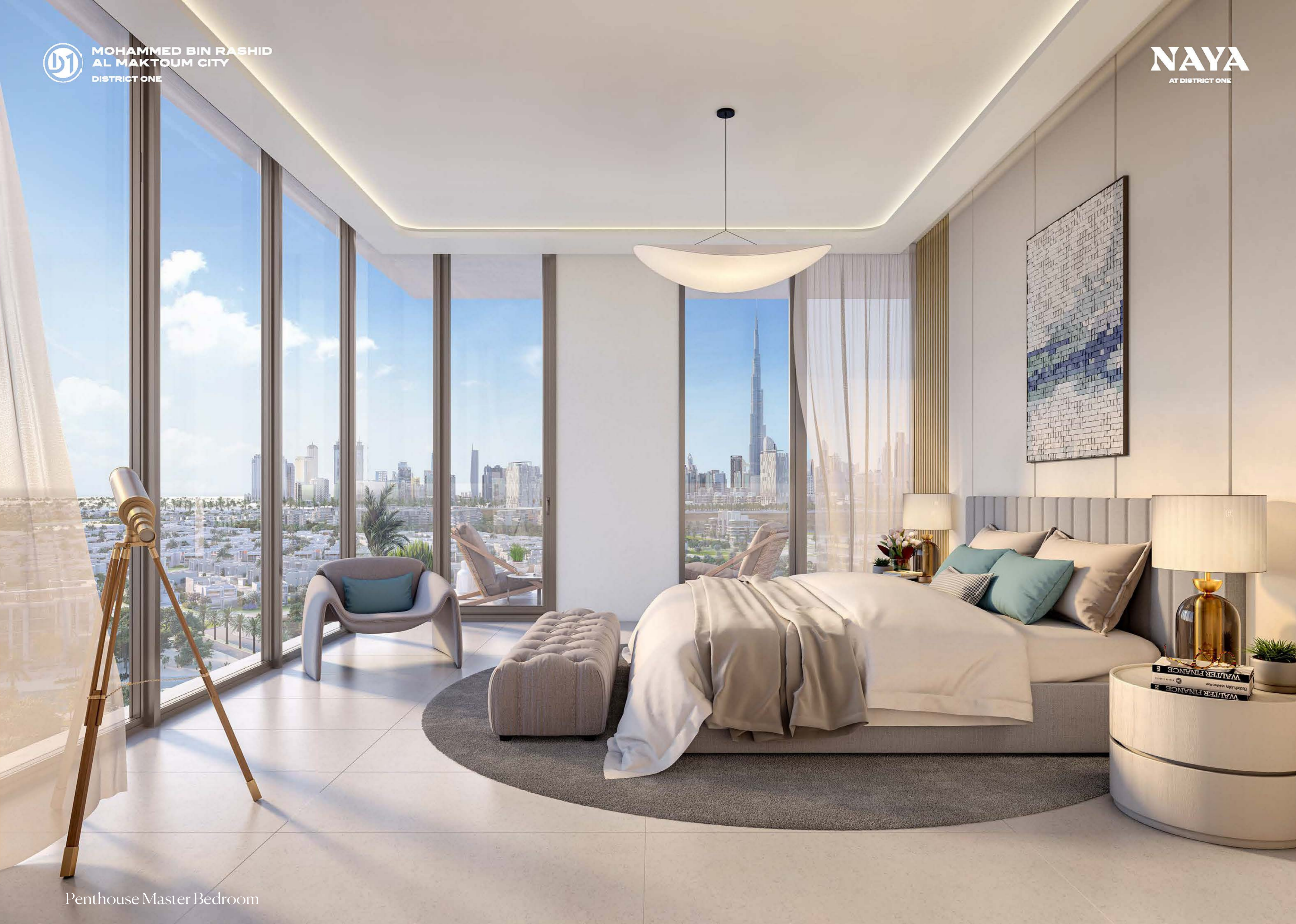
Penthouse Master Bedroom